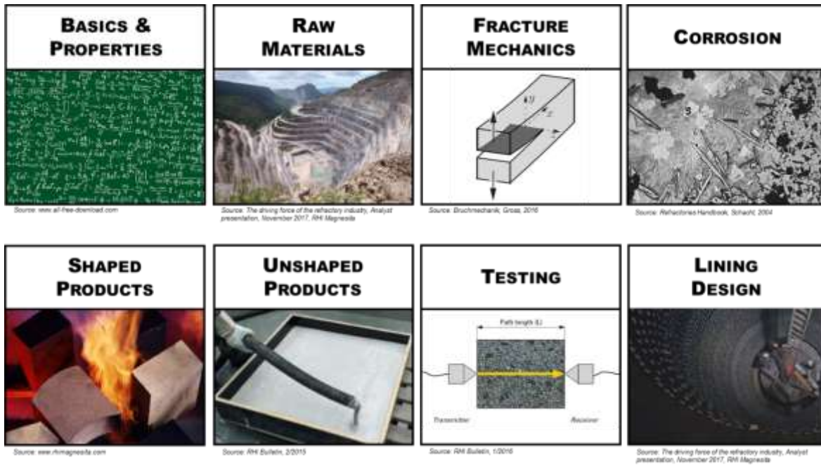
Fig. 2: Preliminary appearance of the topics section prospectively available on ELEANOR platform

After the lifespan of the ATHOR project, the Supervisory Board and all contributing partners will decide about the subsequent use of the gathered content within the Federation for International Refractory Research and Education (FIRE) .